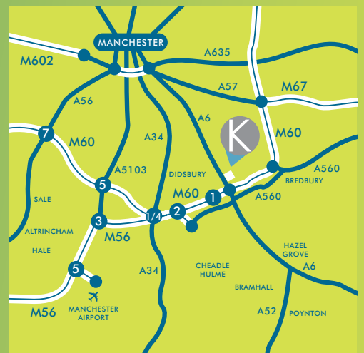
Sat Nav: SK4 1LW